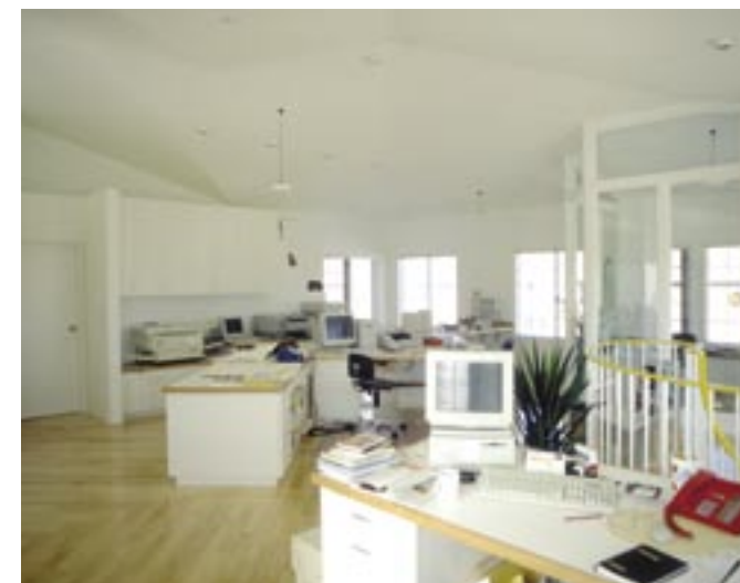
More viewpoints of the studio area and the kitchen. Overhead speakers provide background music. All desk units and cabinets were built to my specifications.