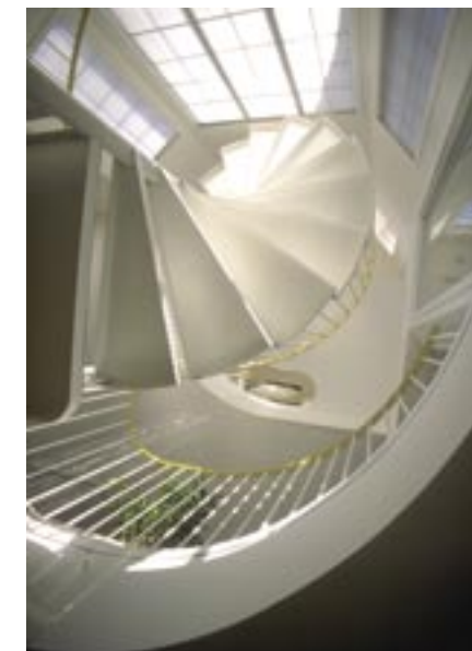
Part of the appeal of the interior is the curvilinear shape of the stairwell.